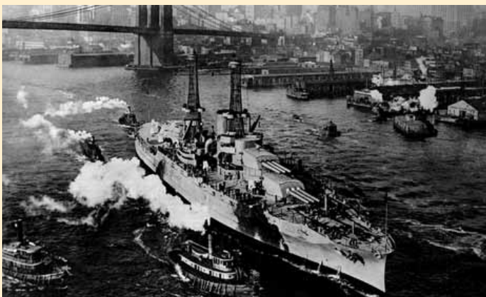
USS Arizona in the East River, New York City, 1916.

A new history museum opened on November 11, 2011, at the Brooklyn Navy Yard with its first exhibit, titled "Brooklyn Navy Yard: Past, Present and Future." The yard was established in 1801 as one of the nation's first five yards. The yard produced many important vessels, including the USS Arizona . But the Navy closed it in the 1970s. The museum now joins several businesses there, and includes a large collection of historical documents, photographs, maps, engineering and architectural plans, and artifacts "relating to the legacy of the Brooklyn Navy Yard and the thousands of men and women who served there during its 165 years of service to the nation," stated former navy Senior Historian Ed-