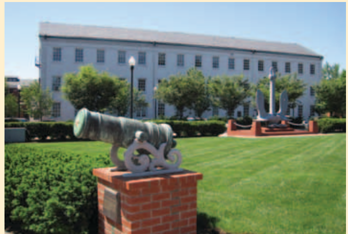
Naval History and Heritage Command headquarters is located at the foot of Leutze Park in the historic Washington Navy Yard, DC. The Venetian 5.75-inch bronze howitzer (foreground) is believed to be a trophy from the early 19th-century Barbary Wars; the gray anchor (background) is from the carrier USS Enterprise (CV 6), which saw significant action in the Pacific theater during World War II.

Once America entered World War I, emphasis shifted to gathering documents, such as war diaries and operational reports, from naval commands deployed in the European theater. To handle the arrival of these records, the Navy established a Historical Section in the Office of the Chief of Naval Operations at the "Main Navy" Building on Constitution Avenue in Washington, DC. The library, by now holding more than 50,000 volumes, remained separate in the State, War, and Navy Building. In 1921 Captain Dudley W. Knox was named head of both the Historical Section and the Office of Naval Records and Library. For the next 25 years he was the driving force behind the Navy's history and archival programs. Knox pioneered an oral history program to complement the developing World War II operational archives. Before the war ended, President Franklin D. Roosevelt commissioned Harvard professor Samuel Eliot Morison to lead a team of historians in preparing the 15-volume History of United States Naval Operations in World War II . Morison relied not only on